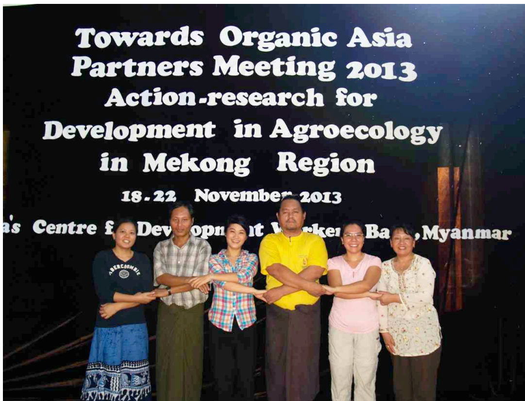
Asian organics joins hand at the TOA Partners Meeting 2013 in Myanmar