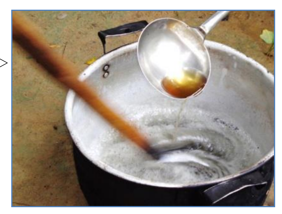
Step 4: Add 250ml of Lemongrass water into the pot and mix well with the other ingredients